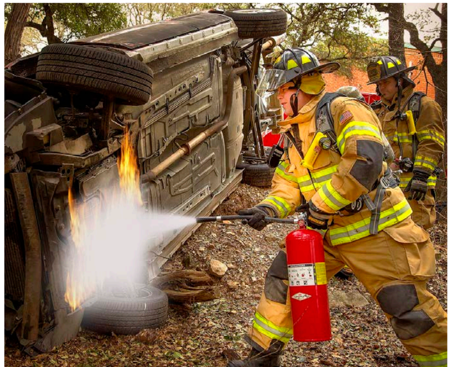
Traffic accidents challenge firefighters' fire suppression and medical skills.