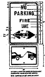
Sign Type "A"