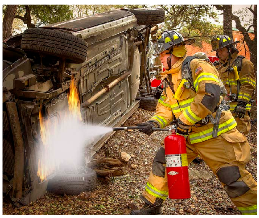
Traffic accidents challenge firefighters' fire suppression and medical skills.